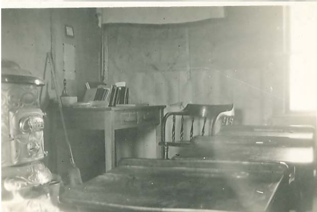
School room in Gallio, Wyoming, ca. 1913.

Recently, the following pictures from Gallio were donated to the Archives.